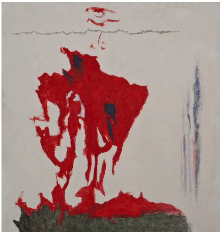
Infinity Field Torino Series III #7, 1987, acrylic on canvas, 60x58 in

Theodoros Stamos (1922-1997), the youngest member of the first generation of Abstract Expressionists, was born in New York to Greek parents. In 1936 he won a scholarship to attend American Artists' School where he studied sculpture until 1939 when he left to focus on painting. Beginning in 1941 he ran a frame shop where he met Arshile Gorky who was influential on his early biomorphic paintings. In 1943 Stamos had his first solo exhibition at the Wakefield Gallery, which was run by Betty Parsons. During this period he also met Adolph Gottlieb and Barnett Newman who wrote about Stamos' paintings with great praise.